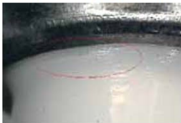
Damage caused by socket

5. The engine is now ready for the new plugs. Use a socket that holds the plugs in place to prevent them from falling during installation. Always use a socket that has a wide bore that does not contact the ceramic. A socket with supports or that is not fully seated on the hex will cause cracks in the ceramic and may even break the plug.