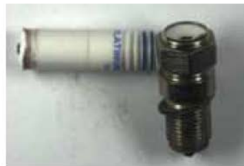
Socket with supports (not recommended)